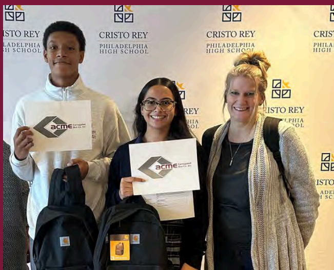
Cristo Rey Students!

In July, Acme Corrugated Box proudly launched our first ESL (English as a Second Language) class for our Ukrainian employees, in partnership with JEVS Human Services. With 25 employees participating, this program is helping them adapt to life in the U.S. by building language skills and fostering a sense of community. We're excited to support our team members on this journey, and it's just the beginning of the opportunities we aim to provide for our diverse workforce.