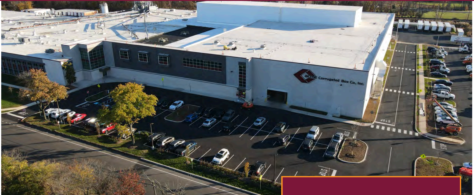
New Windows - See page 6