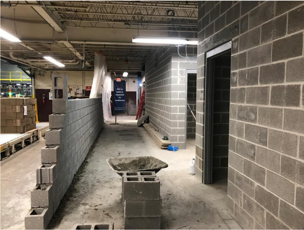
Framing & Masonry – April 2021