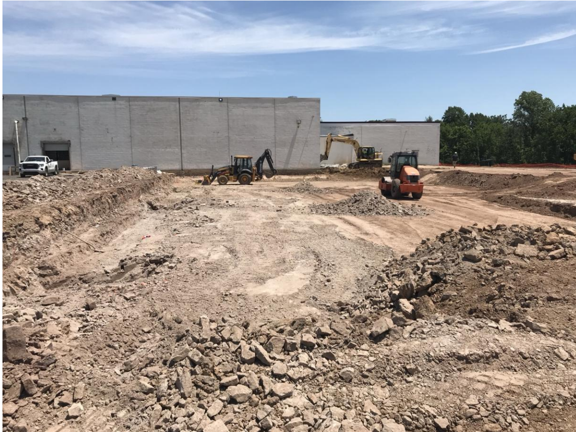
Excavation & backfilling – June 2021