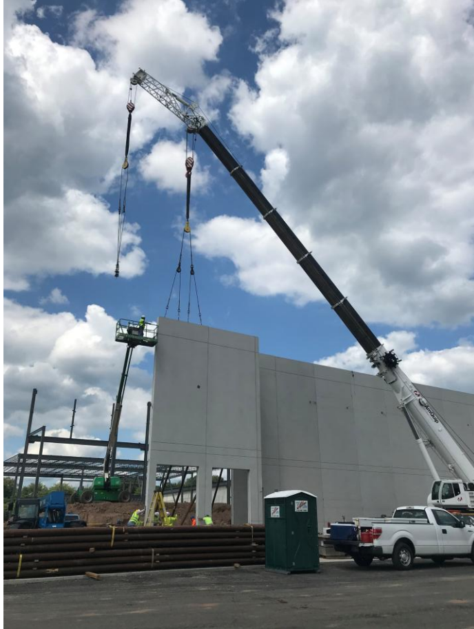
Raising Pre-Fab Panels – Sept 2021