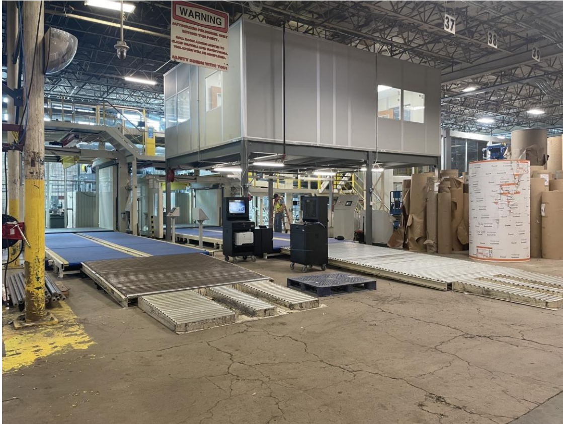
Our “makeshift” takeoff line – Feb 2022