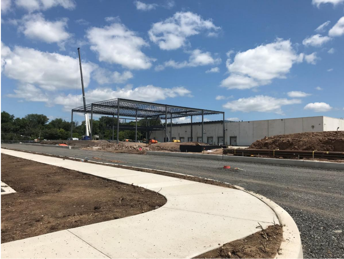
BLDG4 Steel Framing – Aug 2021