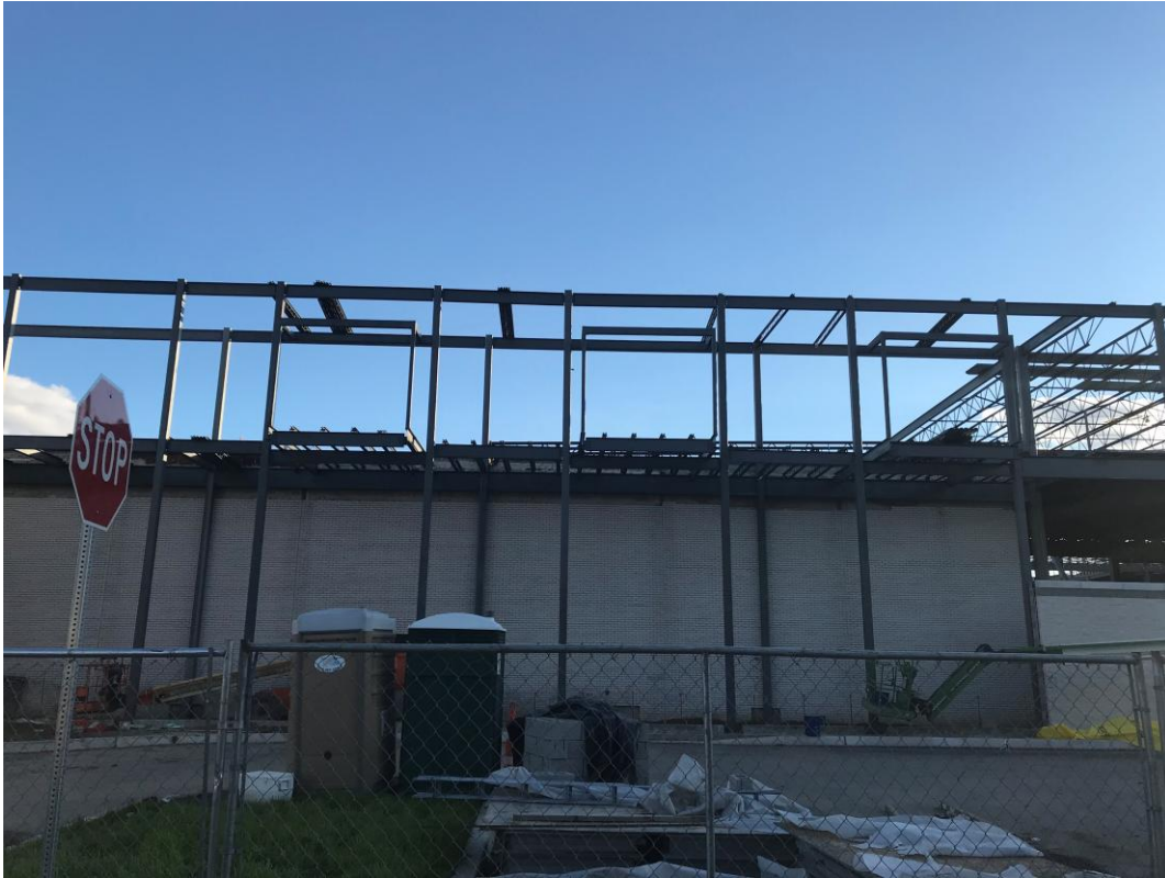
Framing out the steel skeleton – Oct 2021