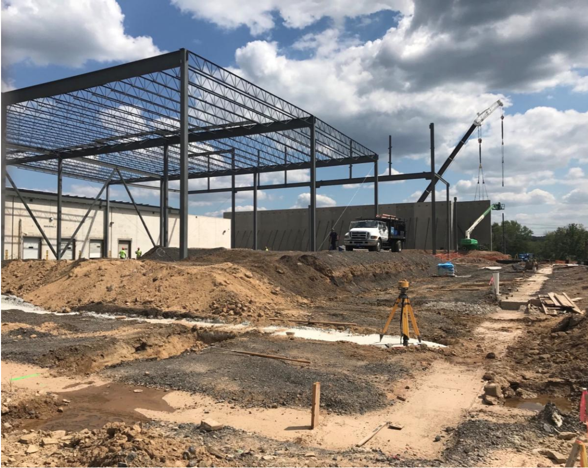
Steel Framing & Wall Install – Sept 2021