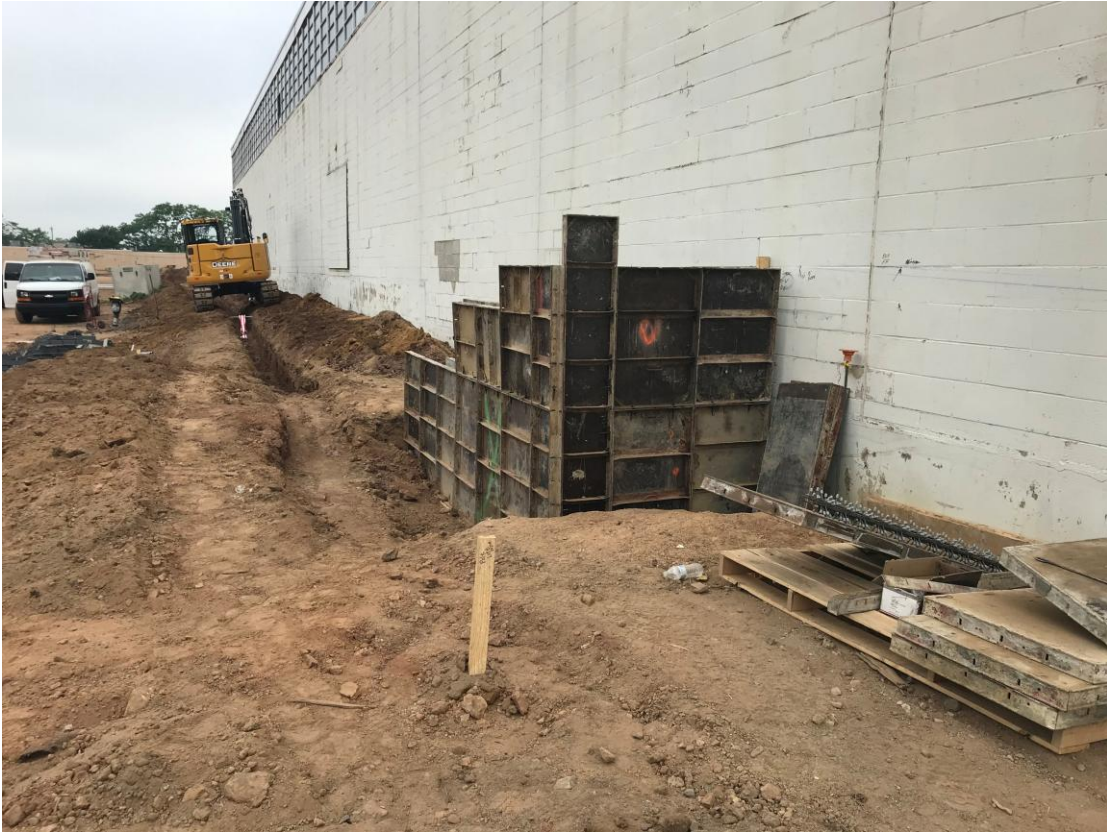
Site Work & Staircase Construction – Feb 2021