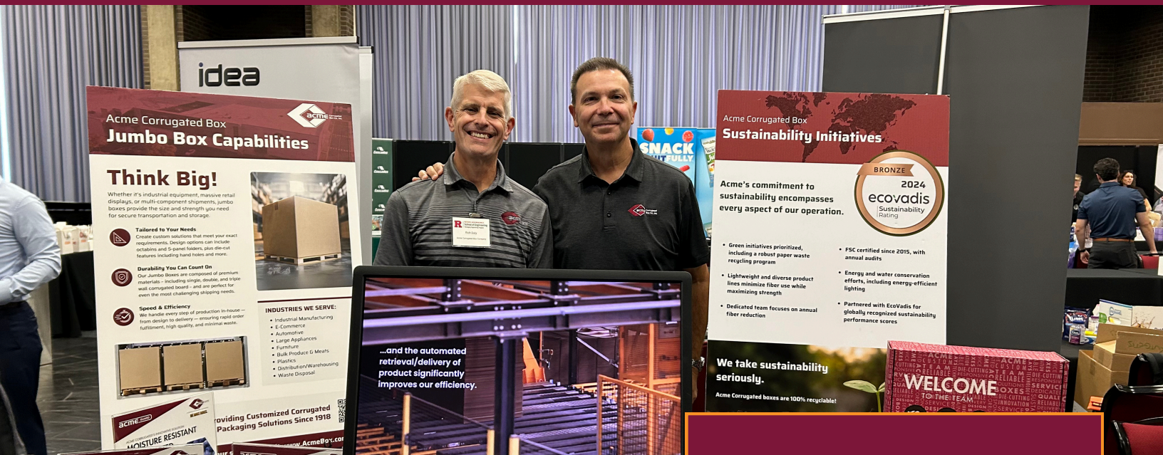
Pictured Above: Rutgers Packaging Engineering Career Night