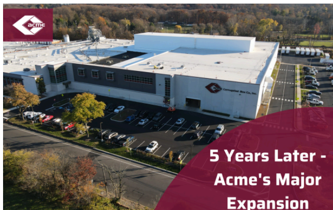
5 Years Later - Acme's Major Expansion